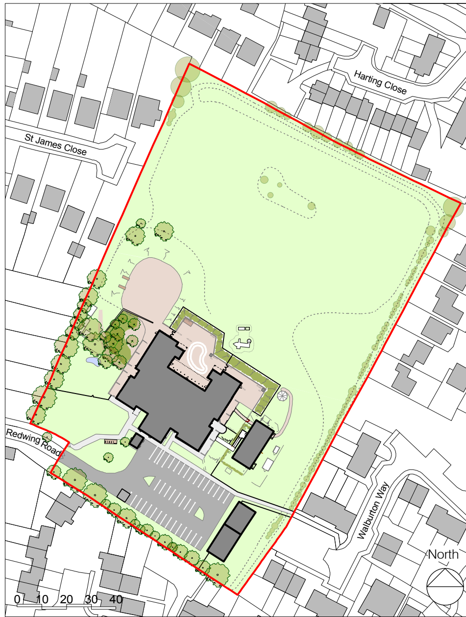
Existing Site Plan