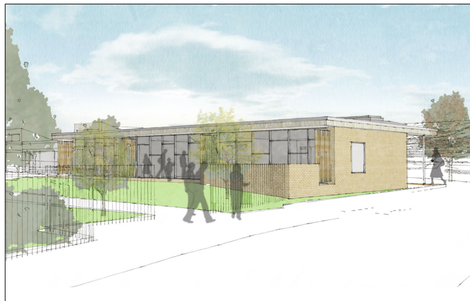
Proposed visual of approach